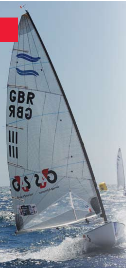
40 ème Semaine Olympique Française de Voile