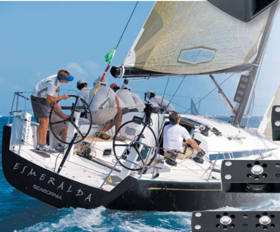
Esmeralda, Club Swan 42, German Frers, Nautor