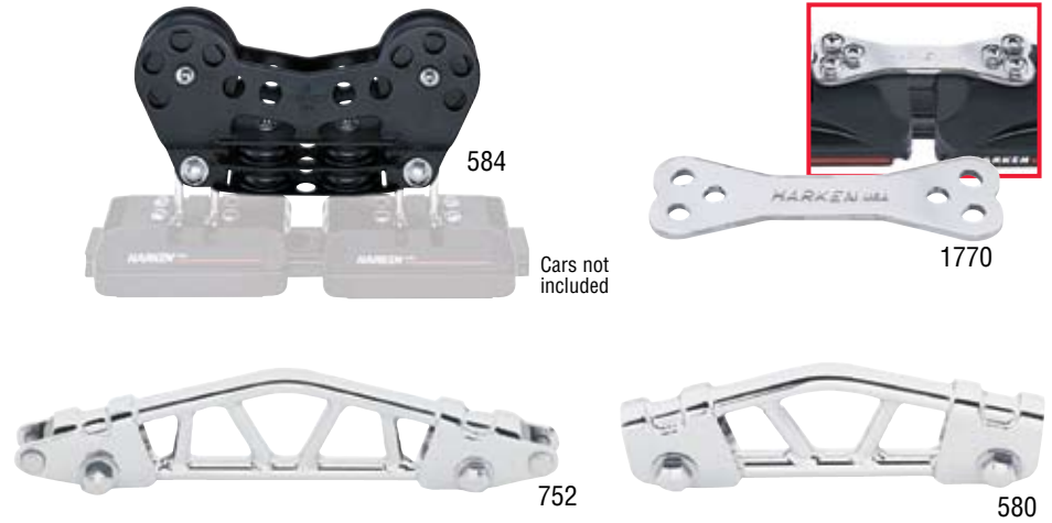
Cars not included

Use high-load 580 and 752 couplers for single-point attachments. Use 1799 control block with 580 or 1770 couplers. Use single, double or triple Black Magic® AirBlocks® with the 752 coupler.