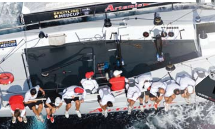
Artemis, TP52, Reichel/Pugh, Cookson Boats