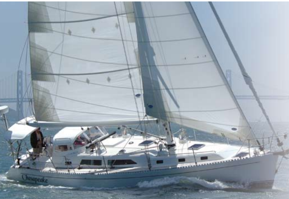
Outward Bound 46